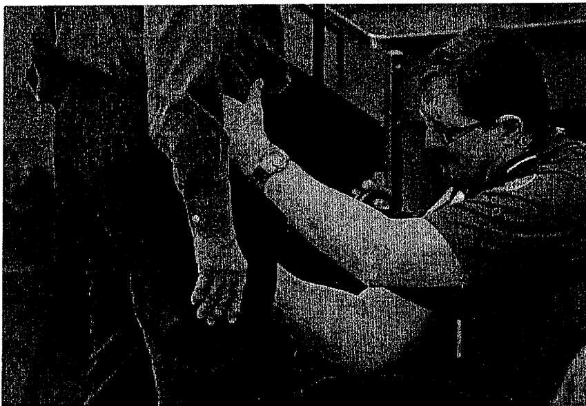
Transportation Security Administration agents perform enhanced pat-downs on passengers at DIA on Wednesday amid growing controversy about the screenings and full-body scanners, one week before Thanksgiving air travelers crowd airports.

Recommend 689 people recommend this. Be the first of your friends.