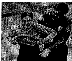
A passenger at Denver International Airport on Wednesday