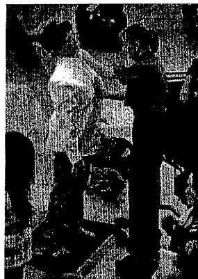
Transportation Security Administration agents perform enhanced pat-downs on passengers at DIA on Wednesday amid growing controversy about the screenings and full-body scanners, one week before Thanksgiving air travelers crowd airports.

Obama asks whether there are less-intrusive options