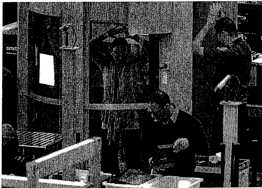
Passengers at Denver International Airport on Wednesday go through a full-body scanner.