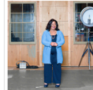
How Does Shonda Rhimes Keep Making Hits?

Home | World | U.S. | N.Y./Region | Business | Technology | Science | Health | Sports | Opinion | Arts | Style | Travel | Jobs | Real Estate | Autos | Site Map © 2012 The New York Times Company. Privacy | Your Ad Choices | Terms of Service | Terms of Sale | Corrections | RSS | Help | Contact Us | Work for Us | Advertise