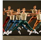
New York City Ballet Season Gala